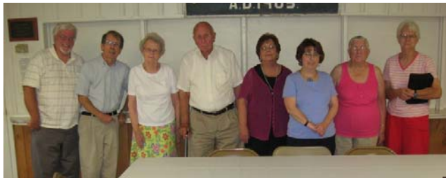
The Wednesday Night Group at Curry UMC

The congregation has a group of about fifteen young adults that will more than likely be the next generation of leaders, carrying the church into the future. But that is with the realization that involvement and leadership will be carried out in a different manner than it has been in the past. This next generation of leadership will come about with the nurture of the current leadership, with an openness to being a permission-giving body for the discovery of new ministries that will be relevant and meaningful.